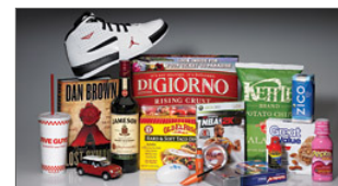
Advertising Age Honors the Top Brands of the